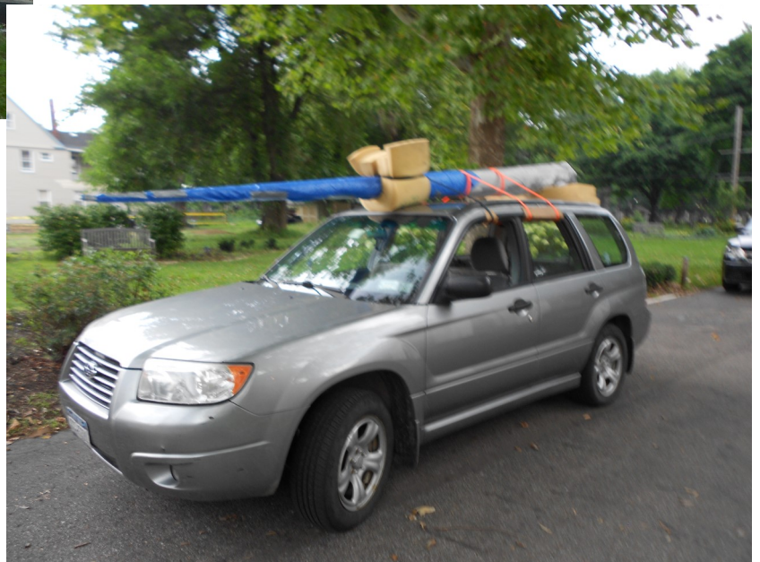
Adam Frelin, Drifter , 2013, Wood

Drifter , a sculpture created especially for this exhibition, evokes the physical aspects of internment, what is visible and what is buried below, through a wooden, carved object partially buried at a 50° angle in the earth at East Cleveland Township Cemetery. Drifter , artificially and ultimately naturally weathered to accentuate the wood grain, encourages tactile comparisons to aged grave markers. The sculpture will be subsequently exhibited out of the ground, displaying the marks of its time in the earth and air of a cemetery.