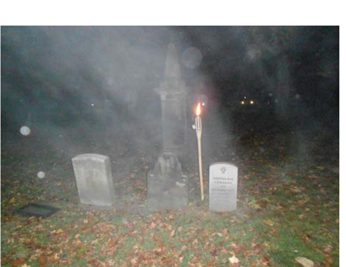
People always ask us about whether or not we get visits from some of our permanent residents. The picture taken by the Edwards monument during one of the tours seems to suggest we had some visitors.